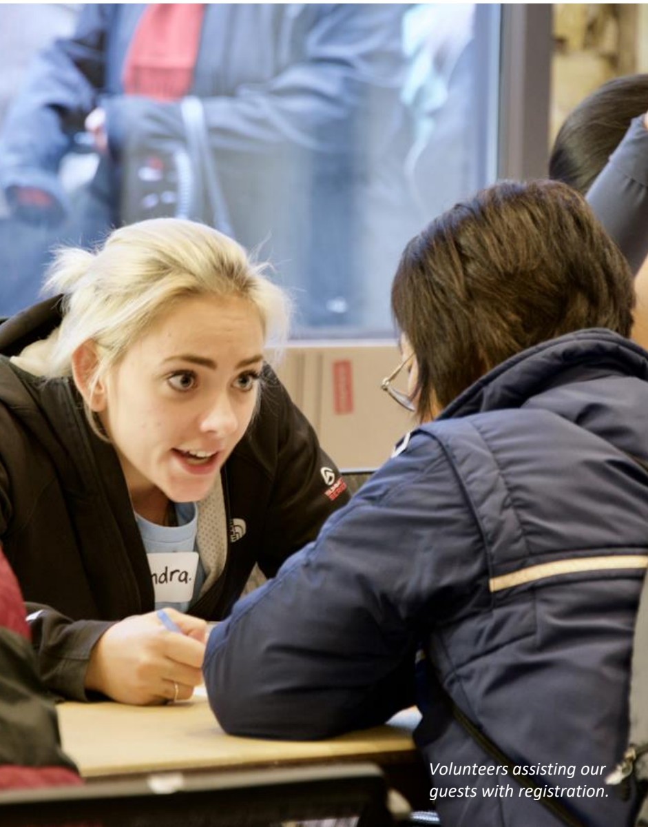
Volunteers assisting our guests with registration.

In terms of partnerships, we were delighted to have received a grant from Green Shield Canada, which allowed the Toronto Public Health – Mobile Dental Bus to provide on-site dental care. We also collaborated with A-Way Couriers, a social enterprise which employs survivors of mental health challenges, to distribute our event posters and flyers to community agencies and deliver lunch on-site at our event. A working group was formed with the City of Toronto – Shelter, Support and Housing Administration, which helped us to bring more housing providers to our events. A new local church, Rosewood Baptist Church, organized and collected clothing for our clothing bank, which was well-received by our guests.