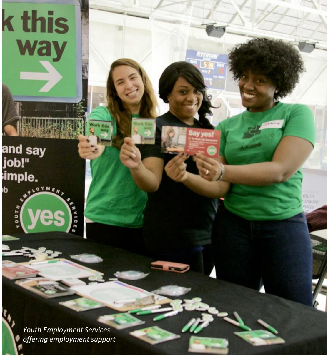
Youth Employment Services offering employment support