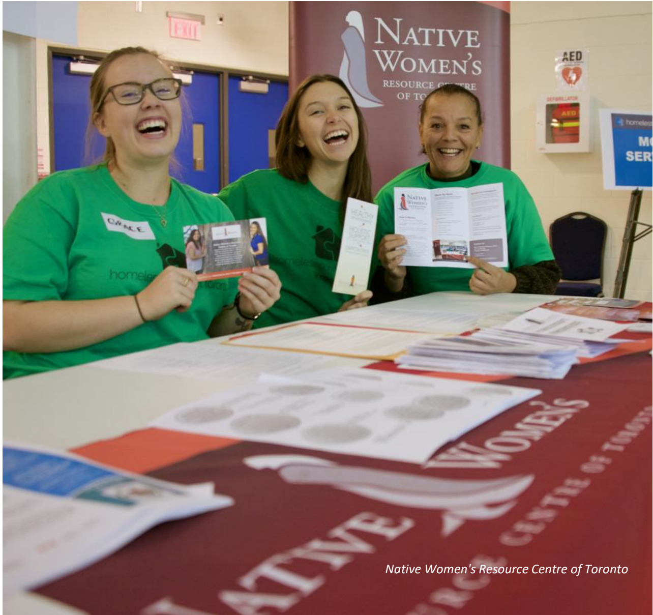
Native Women's Resource Centre of Toronto