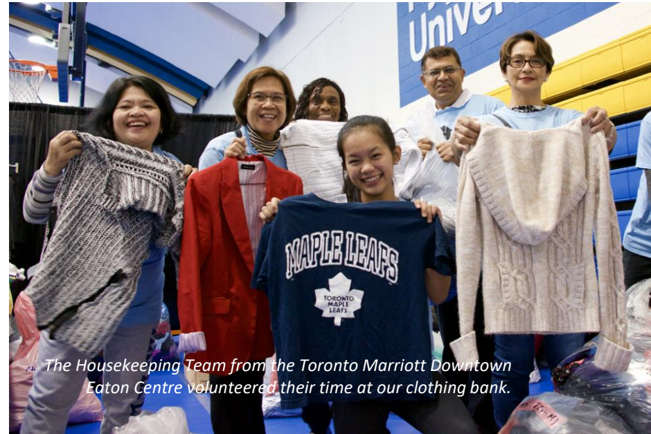
The Housekeeping Team from the Toronto Marriott Downtown Eaton Centre volunteered their time at our clothing bank.